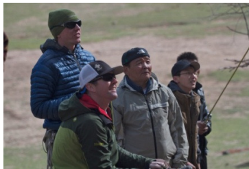
Guests from USA