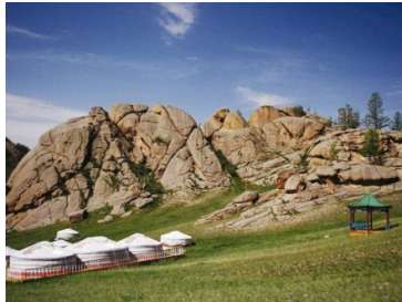
Terelj Ger Camp

"It will be a very good opportunity for our youth to see the stronger climbers in action. Also for them and visitors, it will be good to open new routes in Mongolia, and to be allowed to name the route as the first ascentionist."